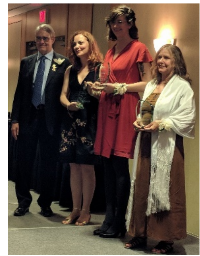
Celebrating Excellence in Health Promotion with the Doctors of BC

1. Disability Tax Credit Application Support – DABC advocates provide one-on-one support by helping individuals who are eligible for the RDSP to apply for the DTC, a pre-requisite for the RDSP. Call their Advocacy Access line at 604-872-1278 or 1-800-663-1278, or email rdsp@disabilityalliancebc.org.